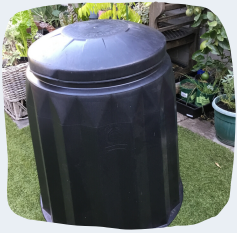
Compost bin (in a sunny spot)