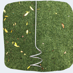
A spiral tool or pitch fork to