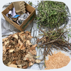
60% carbon materials (plant matter)