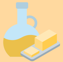
kitchen oil and fats