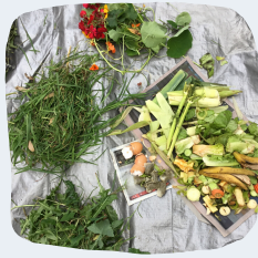
40% nitrogen materials (food waste)