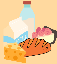
bread & dairy