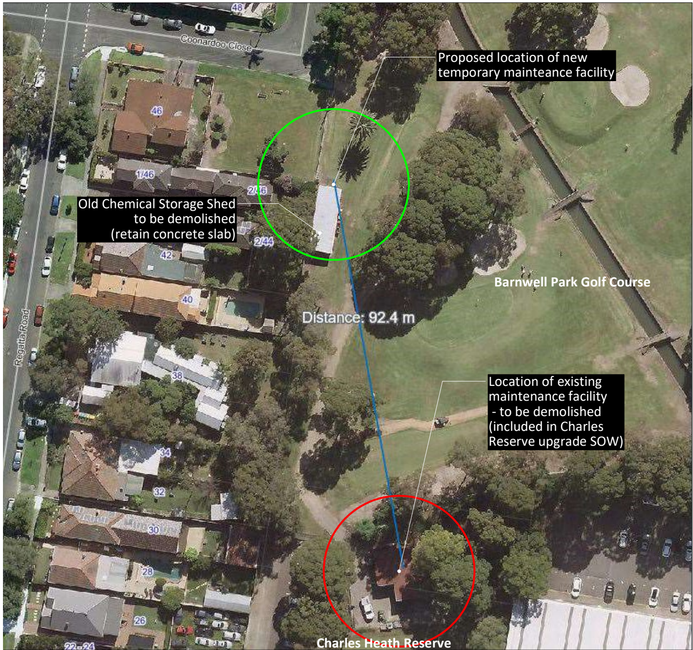
Contextual Site Plan