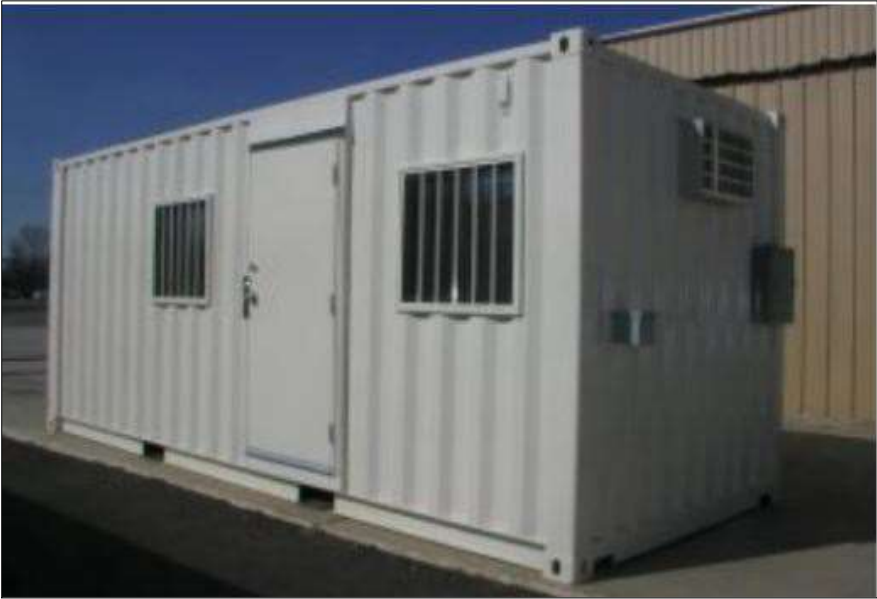
Examples of shipping containers by Conainer Traders Pty Ltd